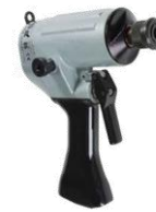
A Fairmont Impact Wrench

This innovative product from Fairmont allows users to be able to efficiently and quickly get the job done with a twin-hammer mechanism, a one-piece handle for a long life, and a button to switch between forward and reverse rotation. Get these impact wrenches at Truck Equipment, Inc. or visit us at our e-store !